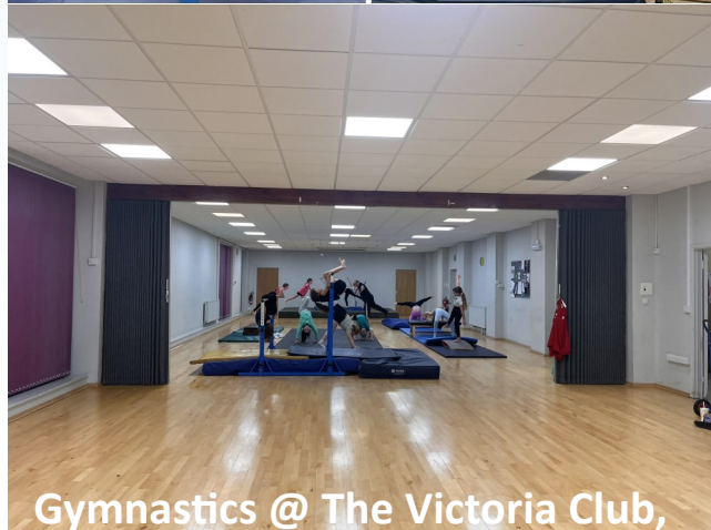
Gymnastics @ The Victoria Club,