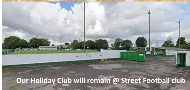
Our Holiday Club will remain @ Street Football club